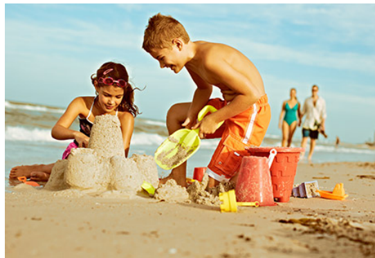
2 children building sandcastles at the beach.

There are lots of things to do on the beach, like swimming, tanning building sand castles, surfing, boating and beach volleyball. This is what we did when we went to the beach.